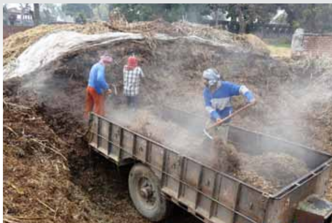
Photo 5. Silage being taken out of silo pit