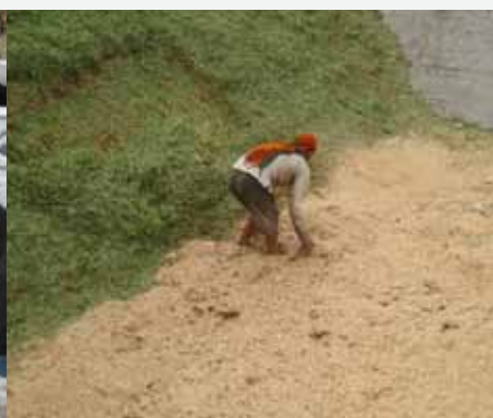
Photo 2. Spreading wheat straw on the floor of silo