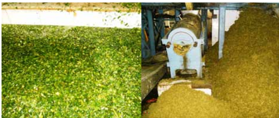
Photo 10. Chopped leaves are washed thoroughly 3-4 times prior to steam cooking