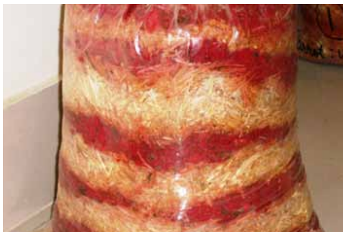
Photo 8. Alternate layers of carrot pomace and wheat straw ensiled in an LDPE tube silo

Non-ruminants: Citrus pulp silage can be included at 5–10 percent in the diet of growing pigs, which reduced the feeding cost. Pigs offered citrus pulp showed significantly lower Enterobacteria counts in faeces compared with pigs in the control group. However, no difference was observed in the Lactobacilli count (Cerisuelo et al. , 2010). Generally, increasing the amount of fermentable fibre in the diet stimulates microbial fermentation in the hindgut of pigs and fermentation generates lactic acid and volatile fatty acids, which are capable of inhibiting some intestinal pathogens e.g. Escherichia coli and Salmonella spp. (Montagne et al. , 2003). Feeding ensiled citrus pulp improved meat quality, without affecting growth performance (Cerisuelo et al. , 2010).