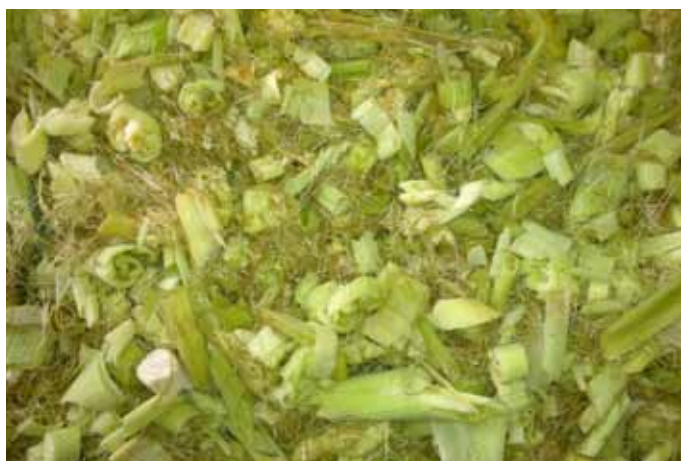
Photo 9. Chaffed baby corn husk

Baby corn is eaten both raw and cooked and is used as a delicacy in Asian cuisine. Thailand is the major baby corn producing and exporting country in the world, while India has emerged as one of the potential baby corn producing countries because of the low cost of production as compared to many other countries. Major baby corn importing countries include the United States of America and other Asian and European countries. About 3–4 picks are taken from each baby corn plant. Keeping in view the increased demand, the cultivation of baby corn has increased remarkably in India. Average baby corn production is about 7.5–8.7 tonnes/ha. Only 15 percent is the edible baby corn cob, while 85 percent is constituted by outer peels with a silky thread like structure called baby corn husk (Photo 9), which is a waste material and is a source of environmental pollution. A number of other by-products are tassels and green plant material. The wastes/by-products, if used judiciously, can give additional income to the growers.