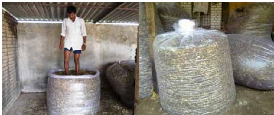
Photo 6. Baby corn fodder being pressed in an LDPE tube silo