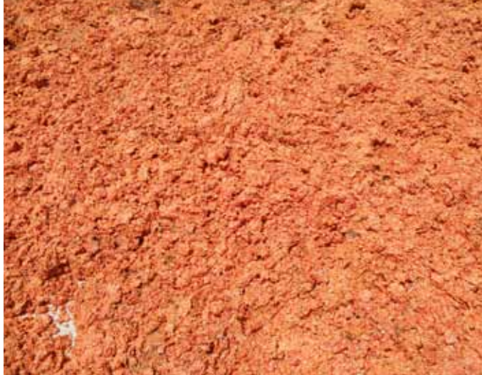
Photo 13. Tomato pomace being sun dried

of tomato and is fed after sun drying and grinding. Unripe tomatoes and the green parts of ripe tomatoes contain a solanine-like alkaloid (saponin) called tomatine that may be toxic to insects, dogs and, to a lesser extent, herbivores (diarrhea, vomiting, intestinal irritation). However, it disappears as the tomato ripens and is not a problem in tomato pomace.