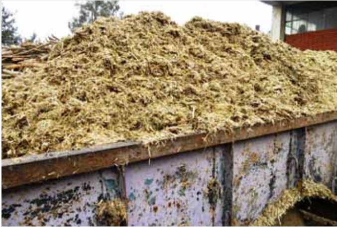
Photo 12. Sarson saag waste being transported by dairy farmer