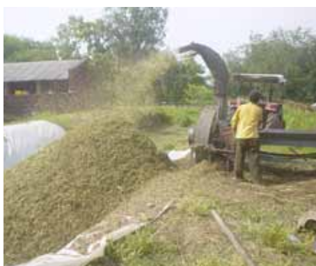
Photo 3. Chaffing and loading in the silo