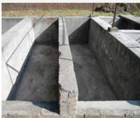
Photo 1. Silo pits