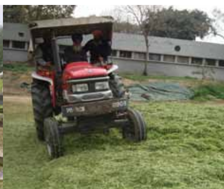
Photo 4. Pressing trench silo with a tractor